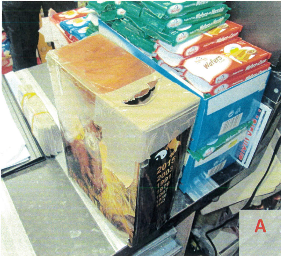
Photographs of cash found in Smiths Convenience Store